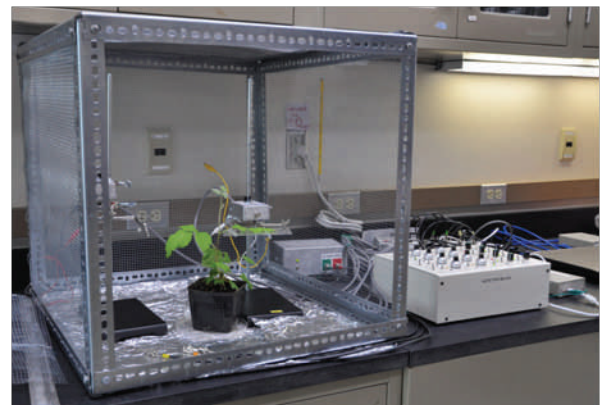
EPG set up with a raspberry plant, probes, and monitor.