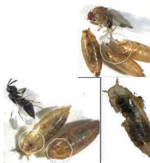
Figure 3. Parasitism by P. vindemmiae can be detected by looking at pupal cases. SWD emerges from a hinged flap in the pupal case (top), while P. vindemmiae chews its way out through a circular hole (bottom left). You can see the wasp developing inside of the fly pupal case (bottom right).