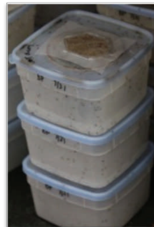
Figure 2. Stacks of collected baits awaiting wasp emergence.