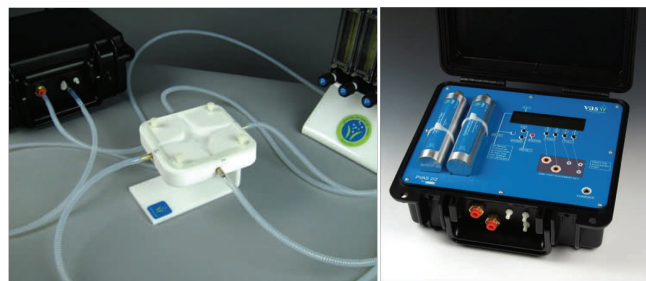
4-arm olfaction arena (left), portable assay system (right)

The International Organization for Biological Control presents the short course Basic and Applied Ecology of the Coccinellidae