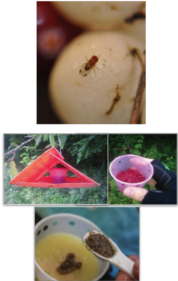
Figure 1. A sentinel parasitoid bait station in an abandoned cherry orchard (top left); raspberries baited with SWD larvae (top right); measuring out larvae onto a dish filled with food medium (bottom).